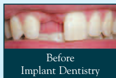
Before Implant Dentistry