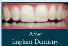
After Implant Dentistry