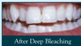
After Deep Bleaching