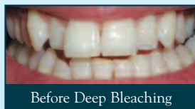
Before Deep Bleaching

With this exciting new technology, you can finally get the extremely white teeth you've always wanted. This procedure is so effective that it even works on discolored teeth that used to be impossible to whiten.