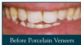
Before Porcelain Veneers