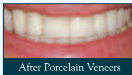
After Porcelain Veneers